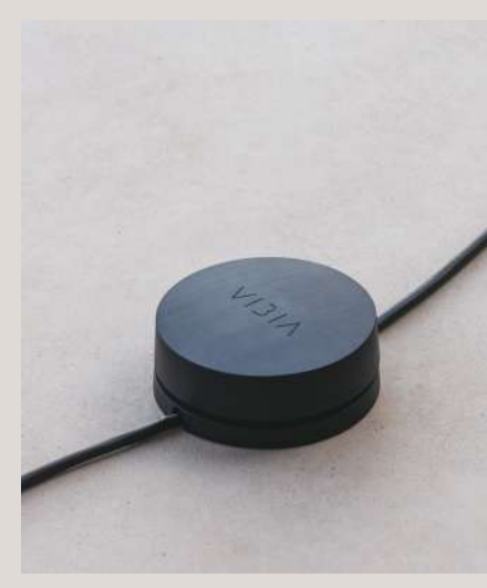
Floor switch ref. 7480, 7485, 7487.